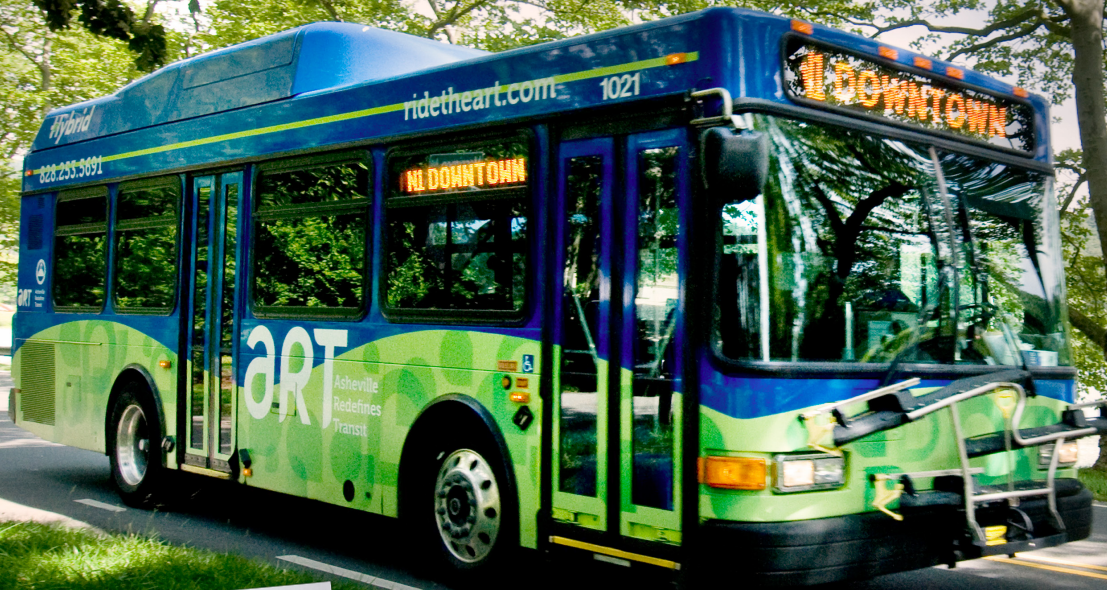
After: the new hybrid buses with the new branding by Studio No. 6

Studio No. 6 Brands Asheville's Transit System