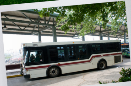
Before: the original 1996 vehicles

Urban Trans and Studio No. 6 were hired to transform Asheville's aging transit system with a new brand and visual identity. The Studio No. 6 scope included system nomenclature, vehicle design, corporate identity, visual identity, advertising and bus passes.